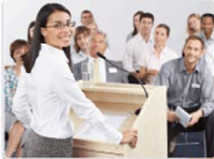
High Performance Leadership A Toastmasters International Leadership Development Program