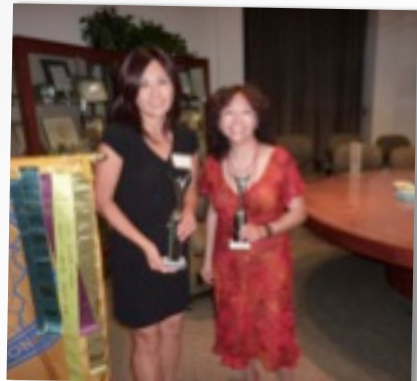
AREA B1 SPEECH CONTEST