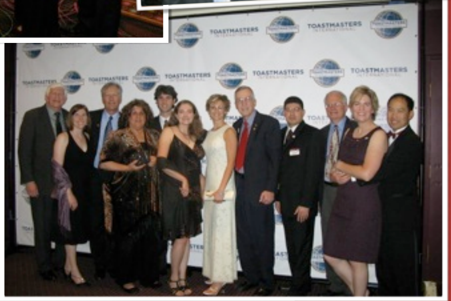
RIGHT - TOASTMASTERS FROM DISTRICT 4 BEFORE THE CELEBRATION OF BELONGING TO DISTRICT 4 - DISTINGUISHED 3 TIMES IN A ROW!